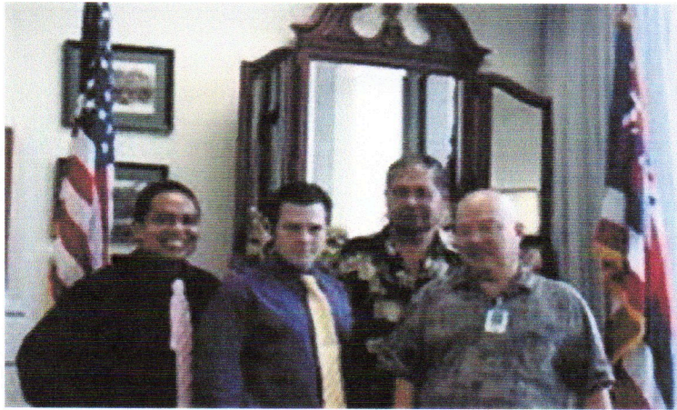
....."This is a pic of my 2012 session staff and I"